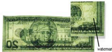
Figure C - Series 1996 and later