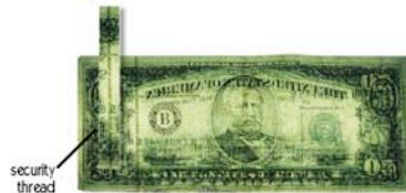
Figure D - Series 1990 through 1995